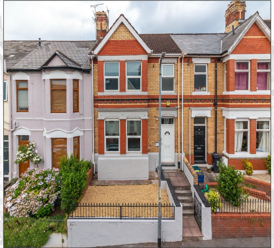
Example of one of our 5-bedroom temporary accommodation properties

At D2 we pride ourselves on being adaptive, proactive, caring and professional. We've been pioneering the way temporary accommodation should be run since 2017, this is why currently 10 Welsh local authorities utilise, respect and value the service we provide.